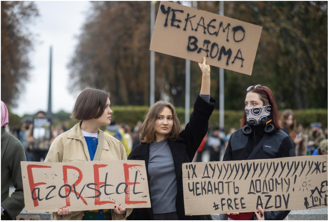
Families and supporters of prisoners of war detained in Mariupol demonstrate in Kyiv for the return of their loved ones. The sign held up (centre) reads: "We are waiting for you at home".

The total number of Ukrainian prisoners of war (POWs) currently being held in Russia and occupied Ukraine is not known.<sup>25</sup> While the Geneva Conventions impose an obligation on authorities to inform the ICRC - and by extension the state authorities and the families of POWs - of an individual's detention, in practice this does not always occur.<sup>26</sup> Families of Ukrainian POWs report that confirmation of detention, where it arrives at all, might come months or even years after they last heard from their relative. In the absence of systematic, comprehensive notification by parties to the conflict, it is not possible to ascertain accurate numbers of POWs.<sup>27</sup> Some missing persons suspected to be in captivity may have been killed in fighting or in its aftermath. Equally, some people presumed missing or killed may in fact be in detention.