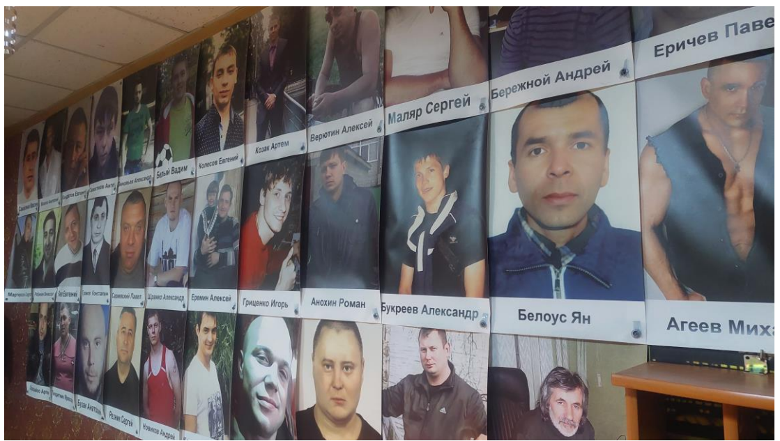
A collection of photos of missing persons in the office of the "Edelweiss" family association. Edelweiss is made up of people whose loved ones have gone missing, they met regularly in the city of Pokrovsk to provide practical and psychological support to one another. Amnesty International researchers met with the association in Pokrovsk in May 2024. The city is now on the front lines of the conflict, with many inhabitants forced to flee.

In 2018, Ukraine's parliament passed the Law on the Legal Status of Missing Persons. This law enshrined into Ukrainian legislation the right of relatives to know the fate of their missing relatives. It also mandated the creation of a Commission on Missing Persons in Special Circumstances, the body with the primary responsibility for fulfilling that right, as well as a Unified Register of Missing Persons (launched on 2 May 2023), intended to be the sole official registry of cases. "Special circumstances" refers to cases of disappearances in relation to "armed conflict, military operations, temporary occupation of a part of the territory of Ukraine, natural or man-made emergencies." Ukraine reported to the UN Committee on Enforced Disappearances in September 2024 that the registry contained 55,000 cases, mainly military but also including up to 14,000 civilians.