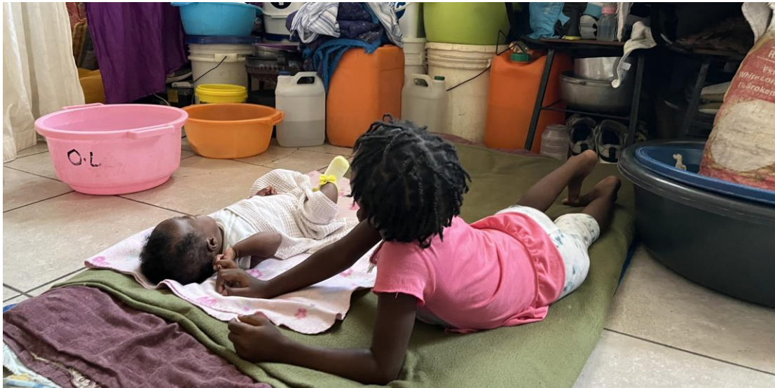
According to the UN, Haiti is experiencing one of the worst hunger crises in the world, with 5.4 million people facing acute hunger. Many children are at risk of acute malnutrition and even hunger-related death.

The government of Haiti is required to respect, protect and fulfil the rights outlined in these treaties. With support from international partners, it should take concrete measures as a matter of urgency to protect children against ongoing and reasonably foreseeable threats posed by the gangs. The abuses committed by the gangs and outlined in this report violate Haitian laws. Additionally, there are international rules and standards that impose direct restrictions on the conduct of armed gangs, including the Convention on the Worst Forms of Child Labour and the Palermo Protocol on trafficking in persons. 55