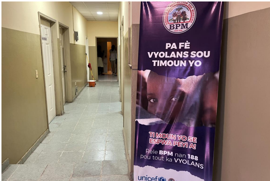
A poster at one of the central offices of the Haitian National Police’s Brigade for the Protection of Minors describes children as the “country’s hope” and warns not to commit violence against them.

These testimonies and digital evidence highlight the extent of work needed to ensure effective community healing for any reintegration process to work. Any reintegration processes must not be top-down. Haitians have had little faith in successive central governments, 135 and so community-based processes that would be more relevant to the affected communities and gain their support should be prioritized.