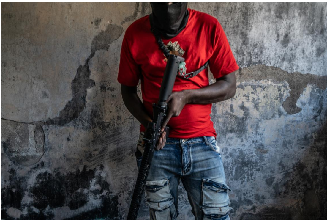
Gang members, such as this one photographed in the capital Port-au-Prince on 22 February 2024, often wear masks in public. In most of the cases documented by Amnesty International, gang members wore masks while raping the girls, an issue that several girls cited as one of the reasons stopping them from reporting the attacks since they could not identify the specific assailants.

In September 2024, Haitian authorities and the UN signed a protocol aimed at the creation of specialized judicial chambers to prosecute “mass crimes, including sexual violence and financial crimes”. 297 Haitian authorities must urgently prioritize the operationalization of the protocol and ensure that these judicial bodies are staffed with professionals specifically trained to attend to victims of these crimes and that they follow victim-centred and trauma-informed procedures. As part of their efforts to ensure effective judicial processes and care for survivors, authorities must also work closely with national and international civil society organizations present in the field and who have been at the forefront of assisting victims and their families.