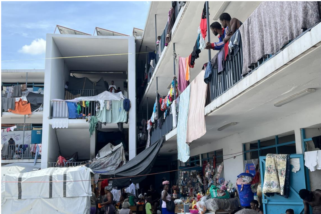
Amnesty International's researchers observed the lack of privacy and crowded conditions in two displacement sites they visited in September 2024. Wide open rooms and uncovered bathing facilities, which aid workers said was common in other camps as well, left girls further exposed.

explain this to you, don't tell anyone, or I will have you killed, or make you disappear.” 253 He then told her that he had digitally raped her, 254 that that was why she was in pain and that there was no reason to cry. When her family found out what happened, they reported it to the police and the man was arrested and is facing legal proceedings. 255 The girl had to move from the camp to a temporary shelter; members of her family stayed behind. 256