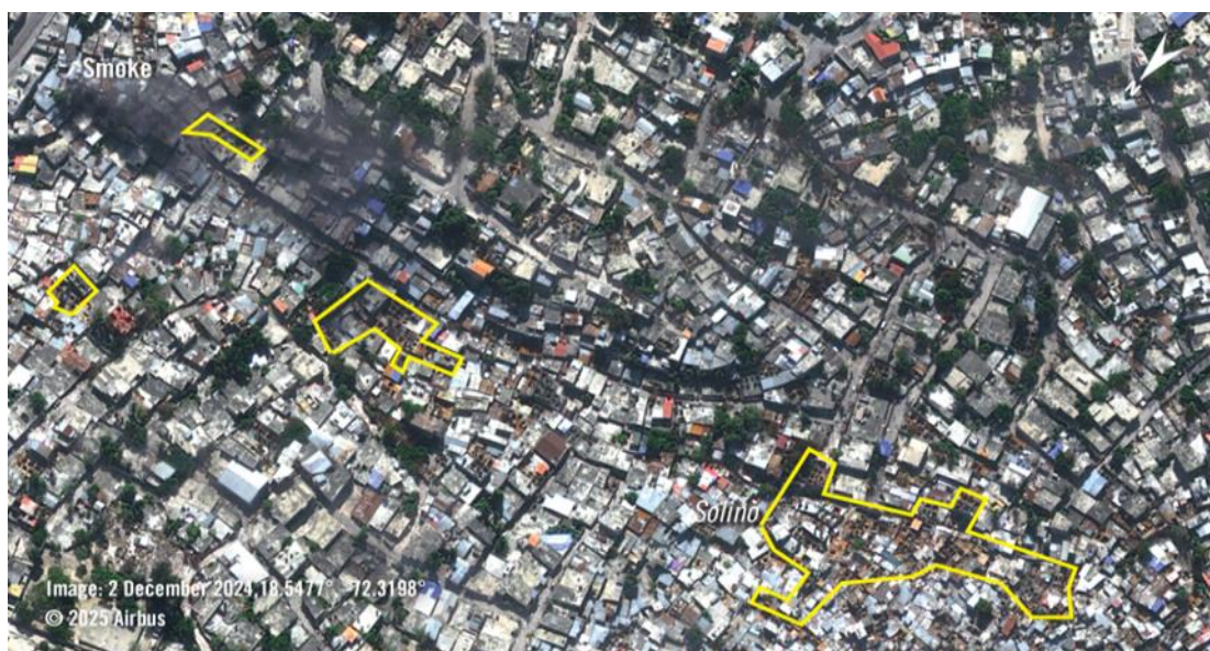
Satellite imagery from 2 December 2024 shows some of the destruction in the Solino neighbourhood of Port-au-Prince, an area that witnessed heavy fighting between gangs and the police. Yellow polygons highlight areas with heavily damaged and destroyed buildings. Smoke is visible rising from one area.

In the carnage of invading neighbourhoods, gang members at times break into homes and murder families at point-blank range. In August 2023, gang members who had stormed into a house in Carrefour-Feuilles shot dead a man and injured his 10-year-old son, two aid workers said. 326 The father was shot between his eyes in front of the child. Amnesty International met the child who confirmed the events and showed researchers the scar on his torso resulting from being shot in the stomach.