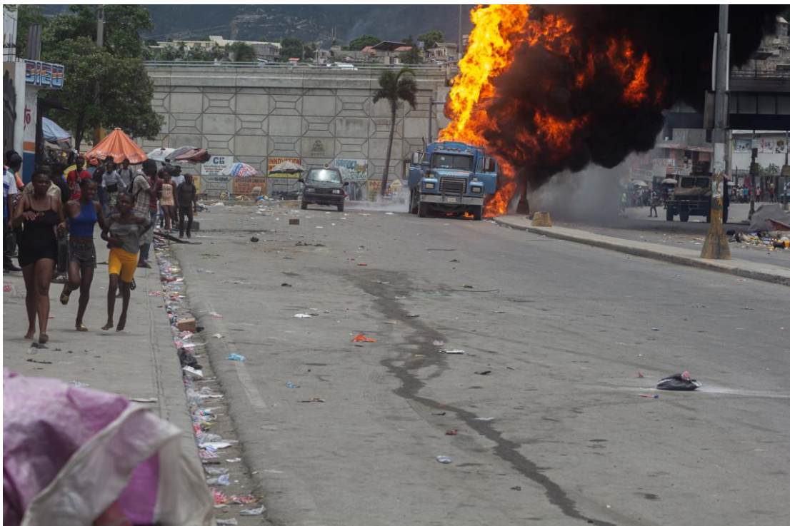
People fleeing after gang members who were trying to seize a diesel tanker fired a projectile causing the truck to explode, Port-au-Prince, 4 June 2024.

“I’M A CHILD, WHY DID THIS HAPPEN TO ME?” GANGS’ ASSAULT ON CHILDHOOD IN HAITI