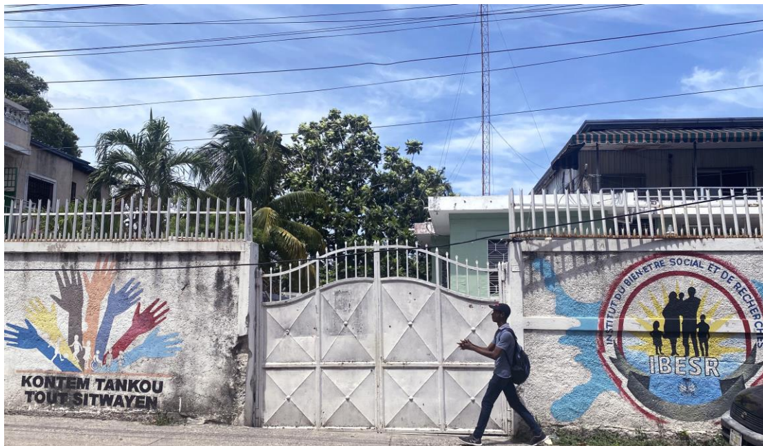
Amnesty International visited the Centre for the Re-education of Minors in Conflict with the Law, or CERMICOL (seen in the top photo), and documented overcrowding and other unlawful detention practices there. Researchers spoke to officials there and at the child protection agency, IBESR (seen in the bottom photo), about issues stalling reintegration.