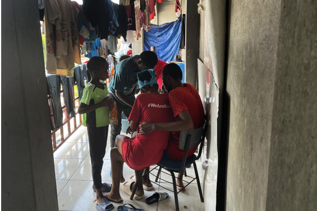
The violence by the gangs has amounted to an attack on childhood itself. It has caused significant distress and trauma and has undermined children's access to education, restricted their movement and deprived them of their ability to play.

More broadly, the UN High Commissioner for Human Rights has recommended that Haitian authorities “relocate immediately all internally displaced persons currently living in squalid conditions in school premises to safe and appropriate facilities, in accordance with international standards”. 426