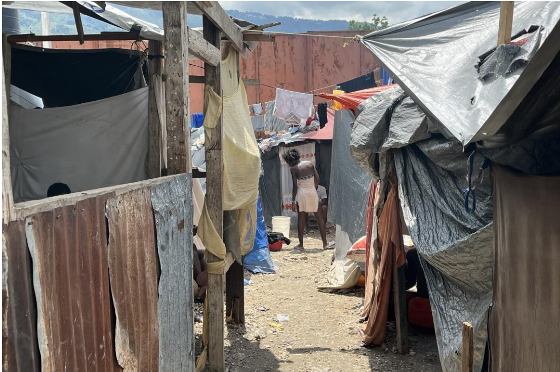
Mass displacement has historically left women and girls in Haiti at increased risk of sexual violence. According to the UN, the repeated waves of displacement in 2024 have caused “unprecedented” levels of such violence.

The CRC also requires states to protect children from sexual exploitation and abuse, including prostitution, as well as from torture, cruel, inhuman, or degrading treatment, which includes acts of rape and sexual violence. 166 In addition, under the Optional Protocol to the Convention on the Rights of the Child on the sale of children, child prostitution and child pornography states must prohibit and prevent the exploitation of children in commercial sex, as well as take all feasible measures to support survivors with their physical and psychological recovery. 167 Regional instruments also require states to prohibit sexual violence. 168