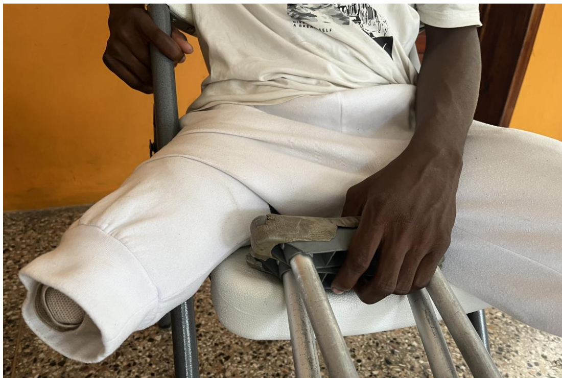
A 16-year-old boy, whose leg was amputated in January 2024 after he was shot by a gang member, was given crutches by an international NGO, but by the time of the interview with Amnesty International in September, the crutches were already falling apart, and he was unable to get new ones.

The mother of the 12-year-old girl with limited mobility who fled Carrefour-Feuilles without her wheelchair in August 2023 said she wanted to buy another one for her daughter to improve the girl's life in displacement, but she did not have the money. Other children with disabilities interviewed in need of assistive devices never had one to begin with. Assistive devices and prostheses are essential to enabling persons with disabilities to live active, independent lives.