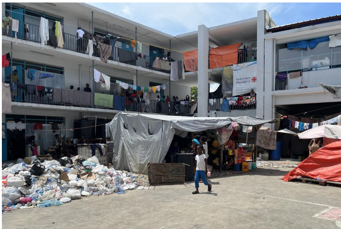
Gang violence has displaced tens of thousands of people. Many have had to take shelter in schools like this one in the capital Port-au-Prince.

By the end of 2024, more than 1 million people – over half of whom are children – were displaced across Haiti. 28 This was a threefold increase compared to 2023. 29 People have been taking shelter in schools, churches, government buildings, open spaces and with host families. 30 Many fled to northern and southern parts of the country, placing increased strain on the facilities and already limited resources there. 31 Close to 180,000 persons are in displacement sites, facing massive protection risks amid extremely inadequate conditions of living, 32 which Amnesty International’s researchers witnessed first-hand.