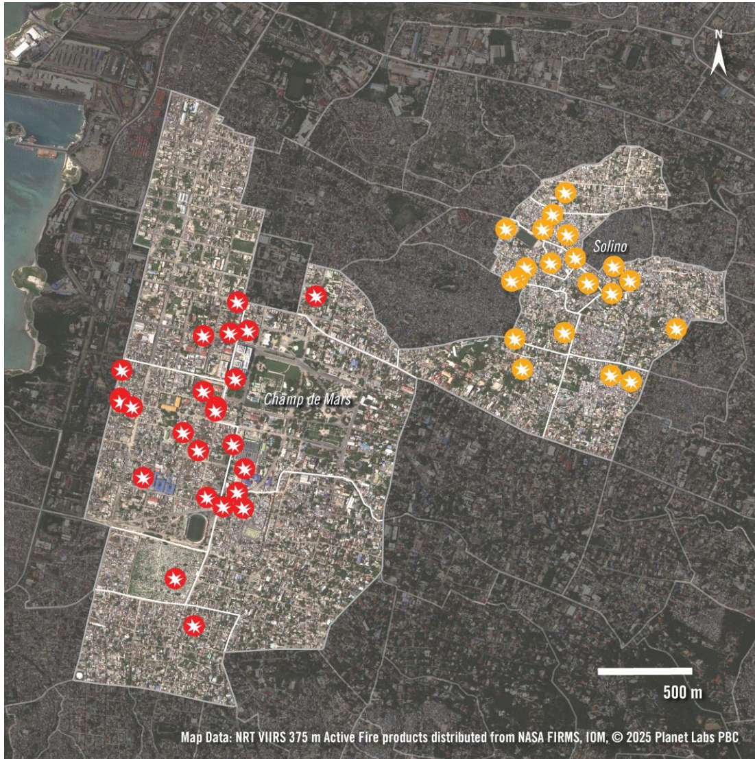
A map of the centre of Port-au-Prince shows fires detected by sensors on NASA satellites during times when heavy fighting and destruction were reported in 2024. A high density and prevalence of fires were detected between 5 February and 1 April 2024 in areas in the west resulting in 24 hotspots, shown with red icons. High density and prevalent fires were also detected to the east between 31 October and 4 December 2024 resulting in 20 hotspots, shown with orange icons. More fires are likely to have occurred than were detected by the sensors.

Testimonies by children underscored the ubiquitous presence of guns around them, including how they are often thrust into their hands and are central in the gangs' acts of violence such as rape. Given that Haiti produces no weapons of its own, containing the illicit trade in arms and preventing diversion of weapons is essential in curbing the abuses committed by gangs. The 14-year-old girl from Cité Soleil who was hit by four bullets in September 2024 said: "I want to tell [the world] to help us change the situation we're in right now in Haiti and remove all the guns... I don't want what happened to me to happen to someone else." 357