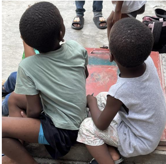
Gangs exploit children in various tasks such as collecting information. With thousands of people displaced by the violence, many children are at risk of recruitment and use by the gangs.

Amnesty International interviewed three girls who were used by various gangs to do chores, such as cooking and cleaning, as well as doing deliveries. 74 Gang members "ask me to buy things for their girlfriends and to clean the house for them... they give me just 250 gourdes [around USD 2] to eat", said a 17-year-old girl who lives in an area controlled by the gang Ti Bwa. 75 A 17-year-old girl who lives in an area controlled by 5 Segon said: "I have cooked so many times for them... sometimes for a group of between 10 and 15 people... the last time I did that was last month... They send me the money; I make the meal and call them to come pick it up." 76