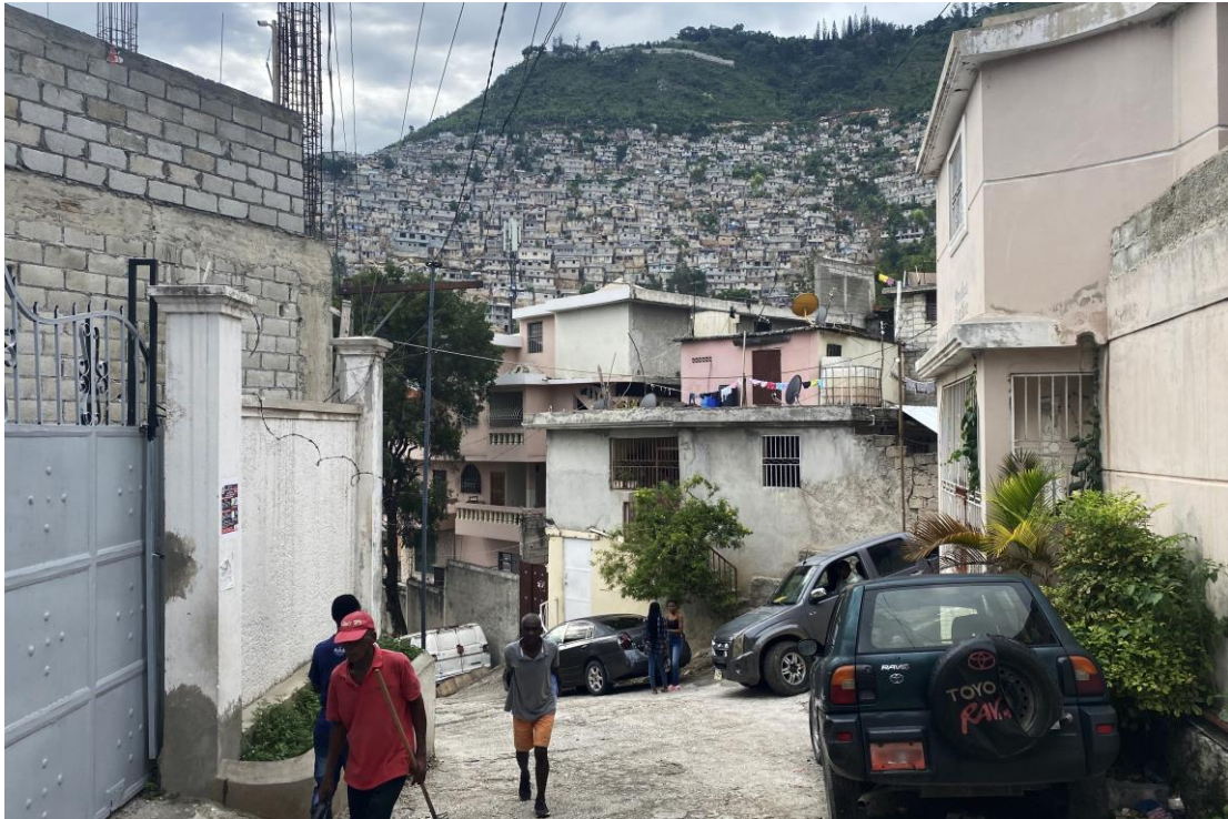
Armed gangs escalated their attacks on the Port-au-Prince metropolitan area and its environs in 2024, taking control of additional areas and further expanding their grip on communities.

On 18 December 2024, Amnesty International wrote to the office of Prime Minister Alix Didier Fils-Aimé, presenting a summary of its findings and requesting information. No response had been received at the time of publication.