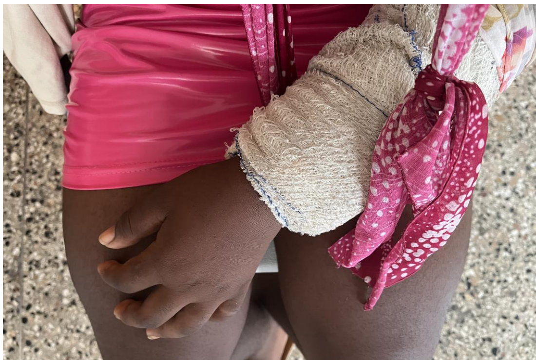
A 14-year-old girl described to Amnesty International being hit by four bullets on 11 September 2024 when gangs clashed after a referee in a football match in Cité Soleil awarded a contested penalty kick.

I was bleeding... I was thinking I'm going to die... I hid in a lottery shop... there were other people hiding there too... I stayed there a while... Someone wrapped my hand to stop the bleeding... Inside, we could still hear the gang members fighting and the shooting outside... I called my mother using someone else's phone... When my mother arrived, we were not able to go outside. Later, someone came to the store and... said we can go outside... We went home... My mother changed my clothes to go to the hospital... Since then, I don't go out anymore, I don't go to see friends... I don't want to be taken by surprise again and find myself shot in the middle of gunfire... Every time I try to sleep, everything hurts. 319