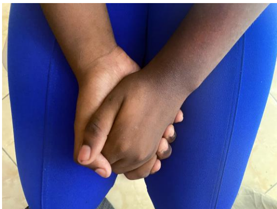
A 16-year-old girl described to Amnesty International being sexually assaulted by a gang member in 2024, one year after she was abducted and subjected to collective rape by gang members.

that I'm pretending to be different from other girls... He continued to yell at me saying, 'You're not the only girl in town!'" she said, adding that she then walked out of the club. 213 In an unrelated incident, the same girl was raped a year prior in Martissant after being abducted from a bus by gang members, held for three days, beaten, repeatedly raped by men and women and forced to do "nasty things" before ultimately being released. 214 Another 16-year-old girl who was also attacked in Martissant said around 10 gang members stopped the bus she was riding in June 2024. 215 One of them had tried to pursue her in the past, she said. The gang members started touching her face and breasts, and when she asked them to stop, they beat her and knocked her on the ground where she lay in shock. 216 She said they stepped away to get their guns, which gave street vendors a chance to hide her. "My father said we would leave, that he would take us somewhere else, but we have no money for that. We have to stay... I'm very scared. I don't go that route anymore," she said. 217