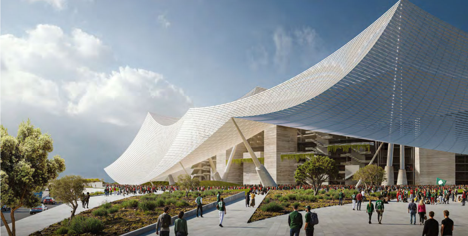
Digital image of the proposed Stade Hassan II stadium in Morocco, projected to be the largest football stadium in the world with 115,000 capacity.

The Spanish assessment provides a wide-ranging overview of the country's legal framework and challenges in relation to several human rights issues including the protection of minorities, minors, gender equality, LGBTI rights, and people with disabilities; migration, environment, and protections for players and fans within sport (including, in particular racism and xenophobia). 15 It does not, however, provide a tailored assessment in relation to specific risks related to hosting the World Cup, nor does it cover some human rights risks identified by Amnesty International and the SRA. Key areas omitted include risks to workers' rights, the excessive use of force by security forces (including the use of rubber bullets), restrictions on freedom of expression and threats to the availability of affordable accommodation.