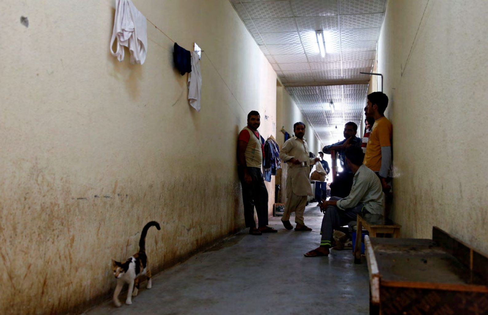
Migrant workers gather at their accommodation in Qadisiya labour camp, Saudi Arabia.