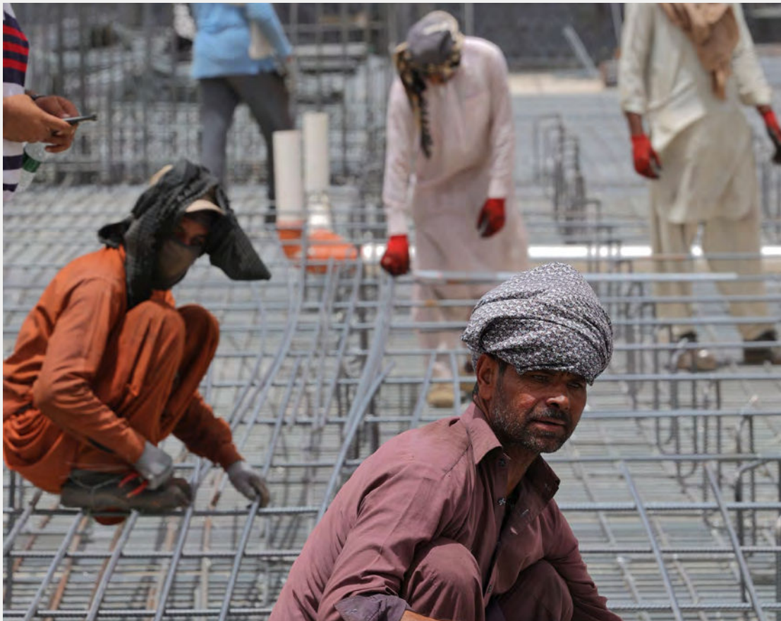
Labourers work on a steel mesh at a construction site in Saudi Arabia's capital Riyadh on May 23, 2022 during a heat wave.

For the 2034 World Cup, the outstanding risks are more severe and the likelihood of widespread violations of human rights in Saudi Arabia – for workers, fans, journalists, residents, players and activists alike – are extremely high. The human rights strategy provided by SAFF does not begin to touch upon the scope and scale of the reforms needed to prevent the 2034 tournament from causing or contributing to severe violations, and clearly does not meet FIFA's human rights criteria. Without change, critical voices will be repressed, fans will face discrimination and workers will suffer exploitation. People will die.