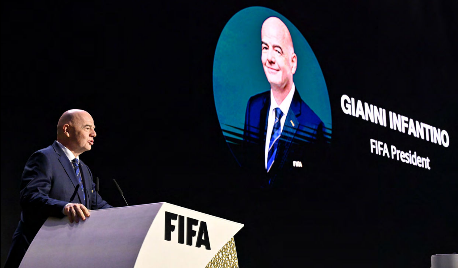
FIFA President Gianni Infantino speaks on stage during FIFA Football Summit 2023 on December 21, 2023 in Jeddah, Saudi Arabia.

3. The assessment relied on desk research and consultation only with government ministries, with no broader consultation. It “did not involve engagement with external stakeholders or rights holders.” 28 Indeed, no human rights organization, trade union, other civil society organization or rights-holders known to Amnesty International or members of the SRA have been consulted – despite Amnesty International and others explicitly requesting this on numerous occasions. It did not make any reference to analysis contained within Amnesty International’s June 2024 report.