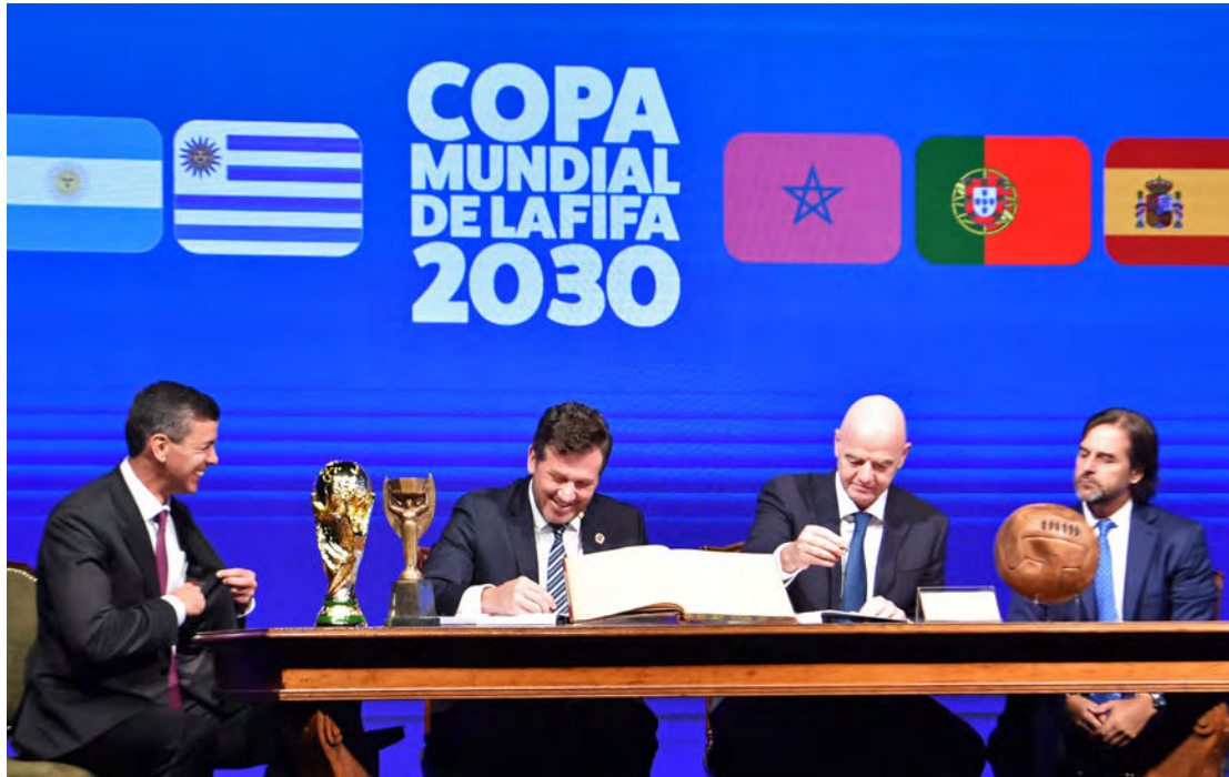
Conmebol's President Alejandro Dominguez (L-2) and FIFA President Gianni Infantino (R-2), accompanied by Paraguay's President Santiago Peña (L) and Uruguay's President Luis Lacalle(R), sign a book of minutes of the 2030 World Cup during Conmebol's 78th Ordinary Congress in Luque, Paraguay on April 11, 2024.

In October 2023, FIFA launched its bidding processes for both the 2030 and 2034 FIFA World Cups, which resulted in only one bid being submitted for each tournament. 3 For 2030, Morocco, Portugal and Spain were invited to submit a joint bid, with three games also to be held in Argentina, Paraguay and Uruguay – who had previously been rivals to host the entire event. For 2034, Saudi Arabia emerged as the sole bidder as FIFA restricted candidates to the Asian Football Confederation and imposed a deadline of under four weeks to apply.