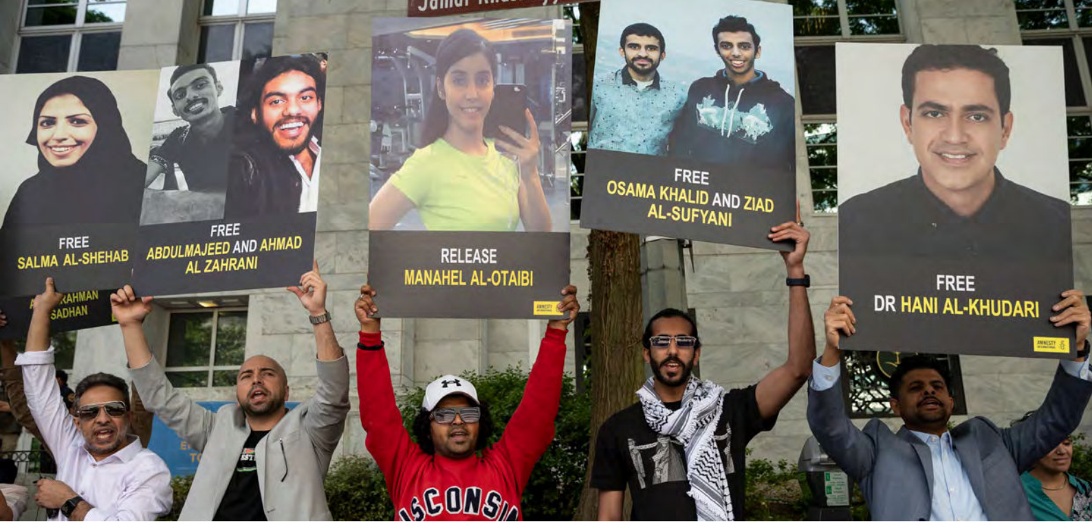
Free Saudi Voices action in front of the Saudi Arabia Embassy in Washington, D.C. calling on Saudi Arabia's authorities to release all those wrongfully detained for exercising their freedom of expression, 2nd of May 2024.