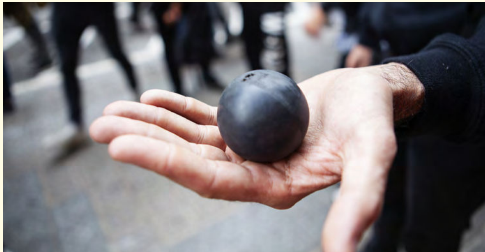
A rubber bullet used by Spanish police forces against protestors in Barcelona, October 2018.