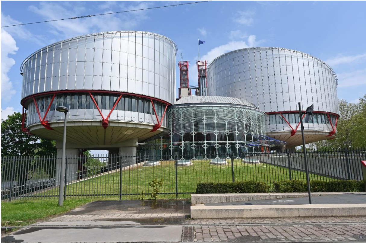
↑ Exterior of European Court of Human Rights, Strasbourg (France)