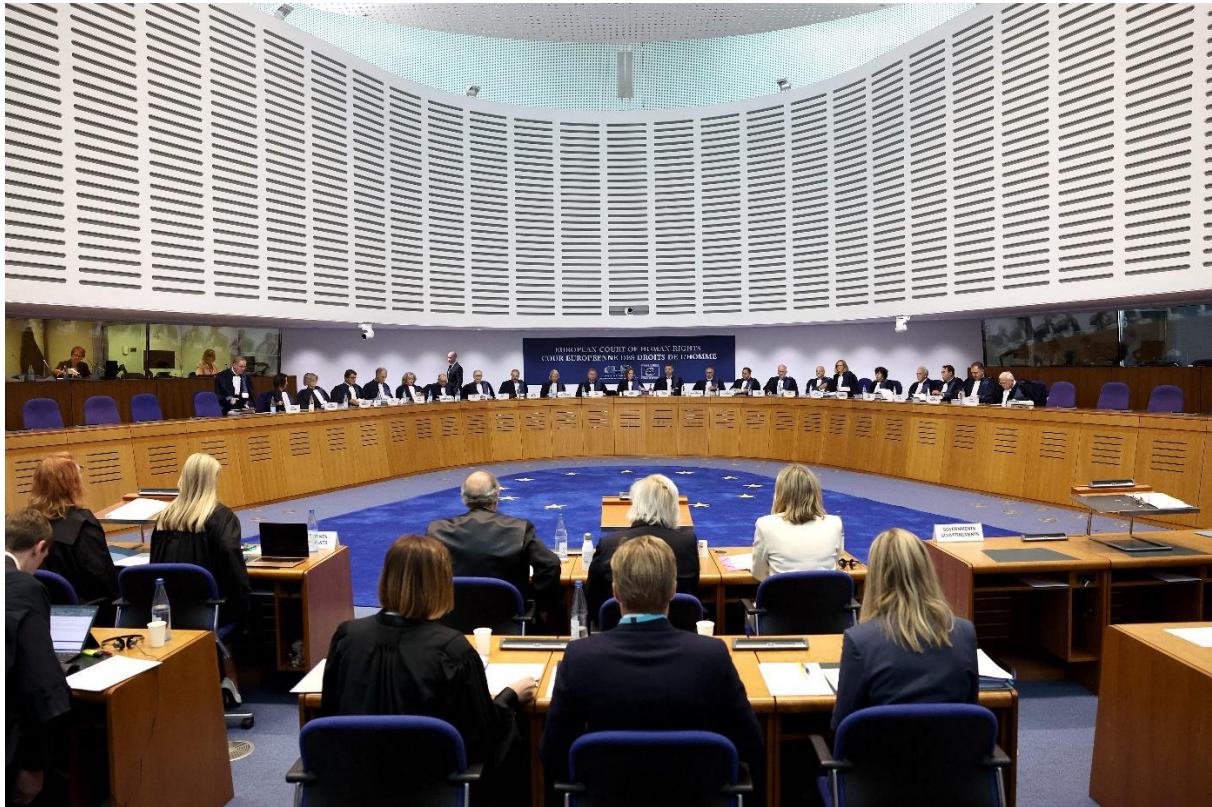
🕒 ↑ Judges of the European Court of Human Rights opening a hearing in the case of Duarte Agostinho and Others v. Portugal and 32 Others , 27 September 2023, Strasbourg (France)

The ability to claim victim status or standing ( locus standi ) before the ECtHR is governed by Article 34 of the Convention, which provides that the Court “may receive applications from any person, nongovernmental organisation or group of individuals claiming to be the victim of a violation by one of the High Contracting Parties of the rights set forth in the Convention or the Protocols thereto.”