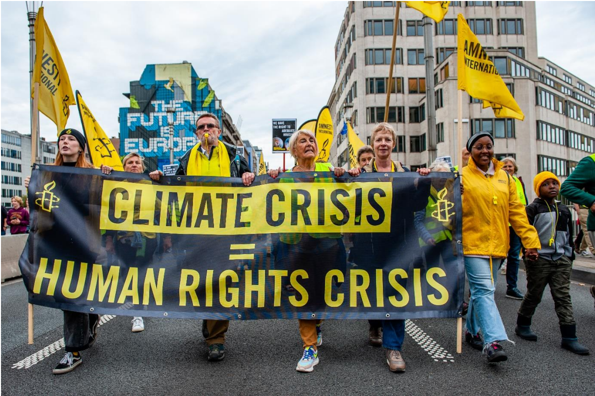
© ↑ “Walk For Your Future” climate march, Brussels (Belgium), October 2022 © Romy Arroyo Fernandez / NurPhoto

In contrast to their findings with regards to the association Verein KlimaSeniorinnen Schweiz, with regards to applicants No. 2 – 5 (the four older women), the Court found that for similar reasons as those articulated under Article 8, “the requested action by the authorities – namely, effectively implementing mitigation measures under the existing national law – alone would [not] have created sufficiently imminent and certain effects on their individual rights in the context of climate change.” 108 The Court held that the dispute had “a mere tenuous connection with, or remote consequences for, their rights relied upon under national law,” and could not have been decisive for their specific rights. 109