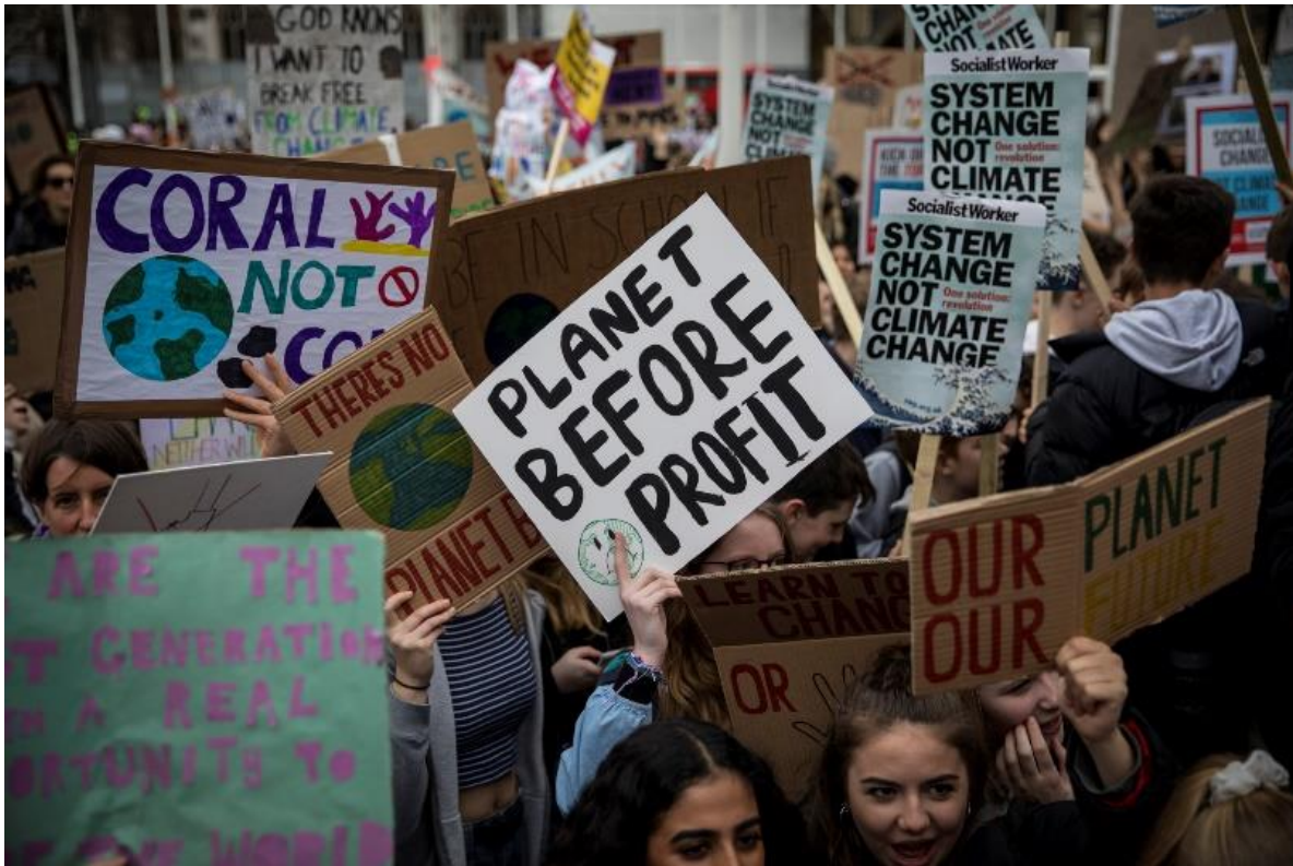
📷 ↑ Student climate strike, 15 March 2019, London (UK)

To assess whether a state is meeting its obligations under the Convention, the ECtHR deems it sufficient for applicants to demonstrate that “reasonable measures which the domestic authorities failed to take could have had a real prospect of altering the outcome or mitigating the harm. ” 138