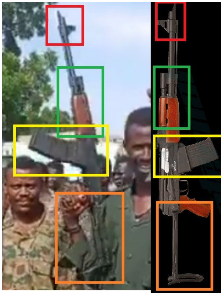
Edited screenshot of the video (with distinctive features highlighted), compared to a FD-63 variant. 66 The shotgun on the left is equipped with a larger magazine.

Shotguns manufactured by small Turkish companies such as Dağlıoğlu Silah, Derya Arms, and Hatsan Arms are also circulating in Darfur in the hands of all parties to the conflict. A video posted on X on 4 July 2023 65 depicting the rendition of SAF fighters to the RSF in front of the RSF headquarters in Al-Daein, East Darfur, shows two FD-63 shotguns, manufactured by Dağlıoğlu Silah. FD-63 are distinctive, and relatively rare, AK-pattern 12GA shotguns with Type 56-1 style foldable buttstocks. While AK-pattern rifles are extremely common in Sudan and constitute a staple of armed groups engaged in the conflict, these AK-pattern shotguns have specific distinctive physical features, including a longer and wider barrel, distinctive muzzle, 90° angled gas block and boxy magazines. Images of these shotguns first appeared online in 2016, indicating the likely start of their manufacture, and any such weapons found in Darfur would almost certainly result from a violation of the UNSC arms embargo.