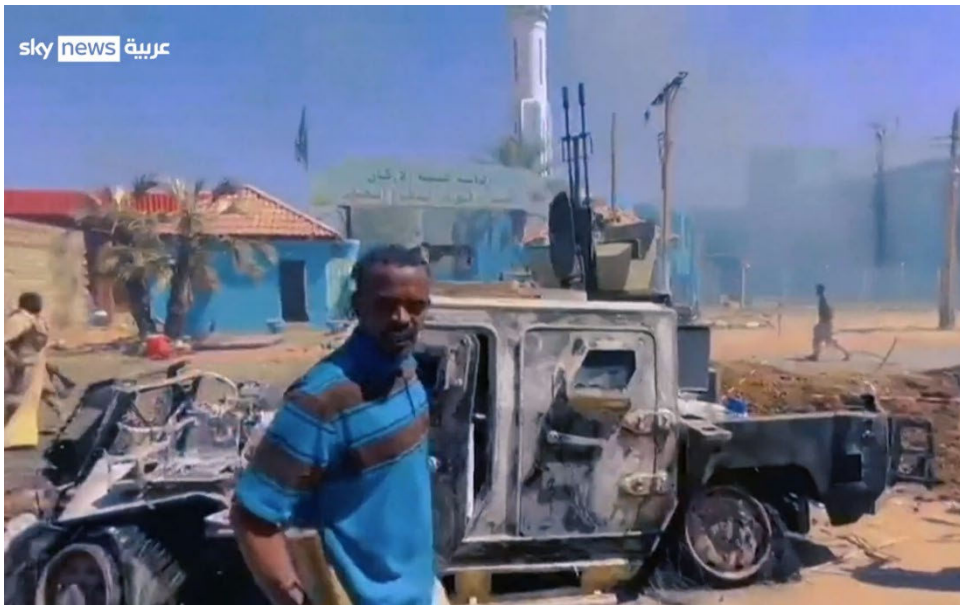
A destroyed NIMR Ajban in Khartoum. 151

independently verify, shows a man claiming to be a SAF soldier and speaking with a North Sudanese accent showing the mostly-illegible data plate from a Nimir Ajban seized by the SAF. 148 Numerous other types of Emirati APCs have been seen in videos in Sudan including at least one Shell Special Vehicles APC. 149 In April 2024, a video that the SAF claims to have shot in Mellit, North Darfur, shows several types of APCs allegedly seized from the RSF, including Streit Gladiator & Cougar APCs, a Terrier LT-79 and several INKAS Titan-S. 150 Contacted by Amnesty, the Armored Group (the manufacturer of the Terrier LT-79) claims to abide by all local and international export regulations and sanctions, including those imposed by the United Nations Security Council and unequivocally states it has never exported armored vehicles to Sudan. Shell Special Vehicles also stated that they have never exported Armored Personnel Carriers to Sudan.