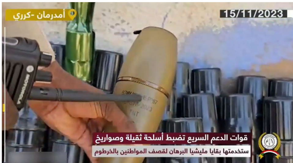
Still from an RSF video shot in Omdorman, State of Khartoum, showing a captured PP87 mortar manufactured in 2023. 125