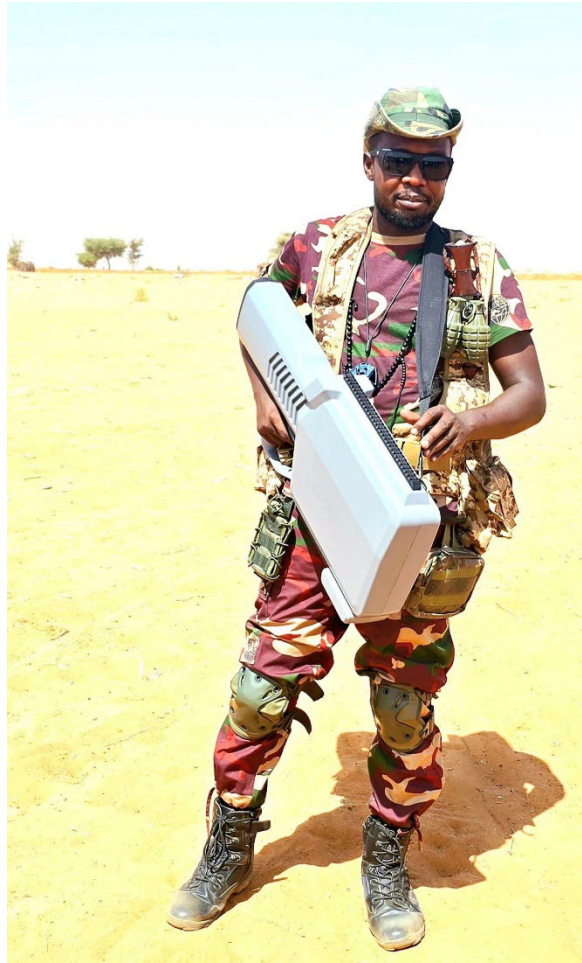
A SAF soldier equipped with a Skyfend Hunter drone jammer. 139

China acceded to the ATT in July 2023. Since then, like Serbia, China has legal obligations under Article 6 of the treaty not to authorize any transfer of conventional arms if they have knowledge at the time of authorization that the arms or items would be used in the commission of genocide, crimes against humanity or war crimes. 140 China is also legally obliged under the ATT's Article 7 to conduct an objective and non-discriminatory assessment of all exports of conventional arms and deny export authorization if there is a substantial risk that the arms could be used to commit or facilitate a serious violation of international human rights or humanitarian law. 141 Furthermore, under Article 11, China must also take measures to prevent the diversion of conventional arms covered by the Treaty. 142