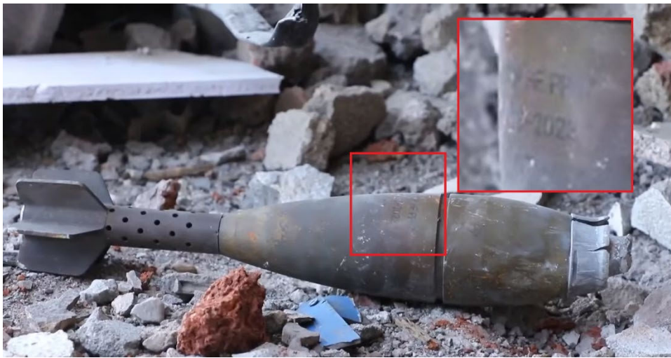
PP87 mortar found in Al-Daein in East Darfur, filmed by Al-Arabiya Television crew. 124

In a report from Al-Daein, East Darfur, Saudi news outlet Al-Arabiya shows a Chinese 122 mortar produced in 2023. Other 2023-manufactured PP87 mortars have been documented in other parts of the country: the RSF for instance seized a number of PP87 mortars from the SAF in November 2023. 123 Amnesty is not able to determine who used these mortar bombs in Darfur, or how they were imported into Sudan.