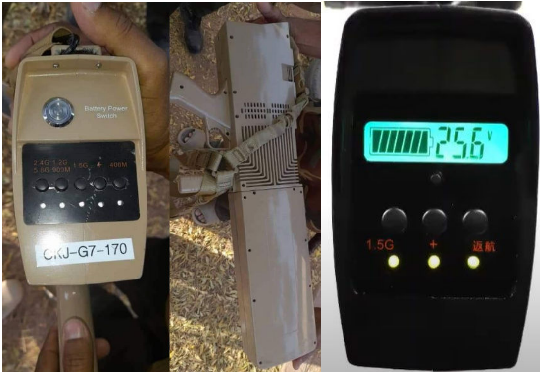
Left: Close-up of the drone jammers, with label marked CKJ-G7-170. 132 Right: control panel of CKJ jammers, as sold online. 133

Chinese drone jammers are also being used by members of the SAF, as seen in recently published pictures 134 showing a Sudanese army soldier equipped with a SkyFend Hunter jammer. 135 While Amnesty International was able to confirm that the picture was recently posted and that the person in the photograph was a SAF member based on his social media activity, it is unable to confirm the alleged location in Al-Gezira State. SkyFend Hunter are manufactured by a Shenzhen-based company, Shenzhen Skyfend Technology Co., Ltd., which has been shipping jammer guns to at least one Russian company 136 sanctioned by the Ukrainian government, in December 2023. 137 These portable drone jammers constitute relatively expensive pieces of equipment: shipment-level trade data indicates that one single Skyfend Hunter jammer is priced at above USD 22,000, therefore representing an expensive piece of equipment. 138