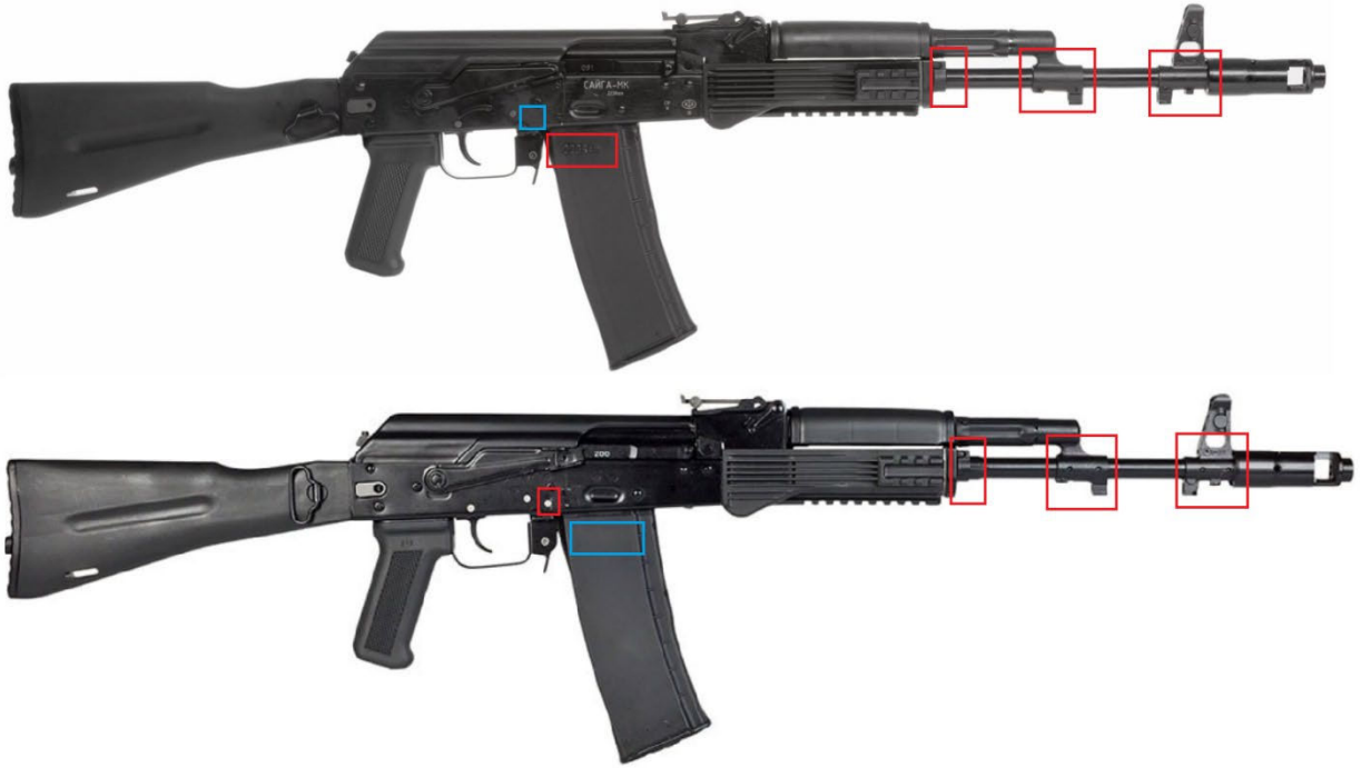
Top image: Saiga-MK 223 Rem. 102 Below: AK-101 103 The Saiga MK has its gas block and front sight pinned to the barrel, as opposed to the AK-101, where they are press-fitted. Additionally, the Saiga-MK lacks an additional rivet immediately above the magazine release catch, and are marked "223 rem" on the magazine.

Saiga-series rifles are semi-automatic rifles manufactured by Kalashnikov Concern and marketed as sport or hunting rifles to the civilian market, while being close copies of their military variants. As will be explained below, Saiga- and AK-series rifles can nonetheless be differentiated by various physical features; the image below shows the main differences between the AK-101 and the Saiga-MK 223 Rem: