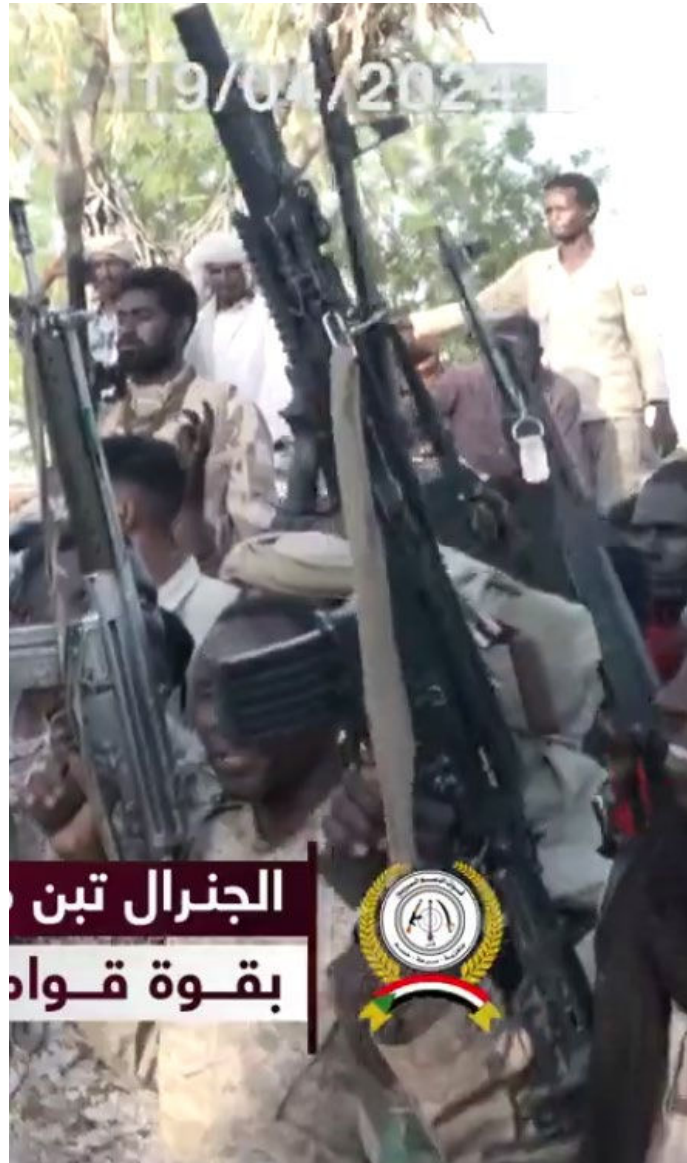
Edited screenshot of a video showing a Derya MK-12 variant in a RSF video allegedly shot in West Darfur on 19 April 2024. 72

numbers of blank guns and rounds, as will be discussed below. 69 Derya Silah MK-12 shotguns, another M-16-pattern 12-gauge platform, have also been seen in use in a RSF official video by the troops of General Taben Mahel, an ally of the RSF in West Darfur. 70 At least 200 of these MK-12 shotguns were exported by Derya Silah to Sudan in February 2023, to a company called El-Sayd Group, for a total value of USD 70,000. 71