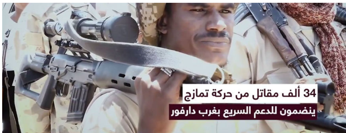
An RSF soldier with a Tigr DMR in El-Geneina, likely in September 2023. 101

Tigr DMRs have been spotted in official RSF videos shot in South, East 97 and West Darfur 98 , in addition to West Khordofan, 99 Khartoum, Omdurman and other locations. 100 While it is impossible to verify when these models were manufactured and transferred - Tigr variants have been produced since the late 1960's - based on several physical features, including buttstock variants, polymer furniture, and their general condition, several Tigr DMRs seen in videos are likely to be relatively recent purchases. Only physical inspection and tracing of the serial numbers on these Tigr DMRs would allow confirmation of this finding.