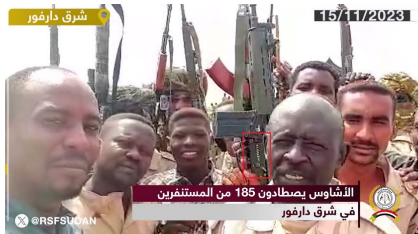
Modified G3 with Al-Marnz markings seen with RSF forces. 145