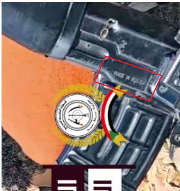
Screenshot of video highlighting "Made in Russia" markings on a Tigr DMR used by the RSF. 96

Tigr DMRs have been spotted in official RSF videos shot in South, East 97 and West Darfur 98 , in addition to West Khordofan, 99 Khartoum, Omdurman and other locations. 100 While it is impossible to verify when these models were manufactured and transferred - Tigr variants have been produced since the late 1960's - based on several physical features, including buttstock variants, polymer furniture, and their general condition, several Tigr DMRs seen in videos are likely to be relatively recent purchases. Only physical inspection and tracing of the serial numbers on these Tigr DMRs would allow confirmation of this finding.