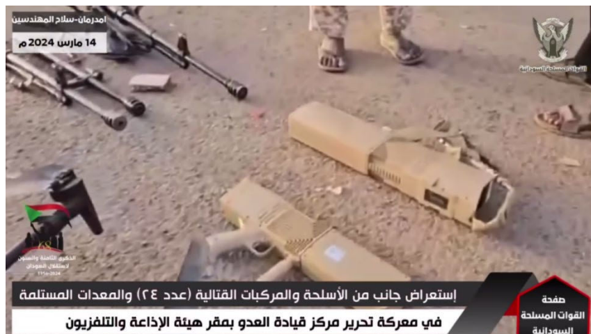
Drone jammers seized by SAF in Omdurman. 131

During the SAF Omdurman offensive in March 2024, after which the Sudanese Army claimed control of the national broadcasting building in Omdurman, several videos surfaced online showing drone jammer guns seized from the RSF. The vents pattern of these drone jammers match those produced by a 2010-founded, Shenzhen-based company, Ching Kong Technologies. Private photographs provided to Amnesty International researchers, show labels with a model number, CKJ-G7, that matches those of the CKJ Jammer series by Ching Kong Technologies. 129 The jammers seen in the pictures below appear to be an advanced version of those sold by Ching Kong Technologies on its website, as not only are they fitted with a handle, but based on the markings of the control panel, they seem to be able to interact with a wider range of frequency bands. These elements, in addition to the sand/camo finish, do suggest that the drone jammers seized in Omdurman were a military version of the CKJ jammers. 130 Amnesty International is unable to confirm if these were exported directly to Sudan or to another country in the region.