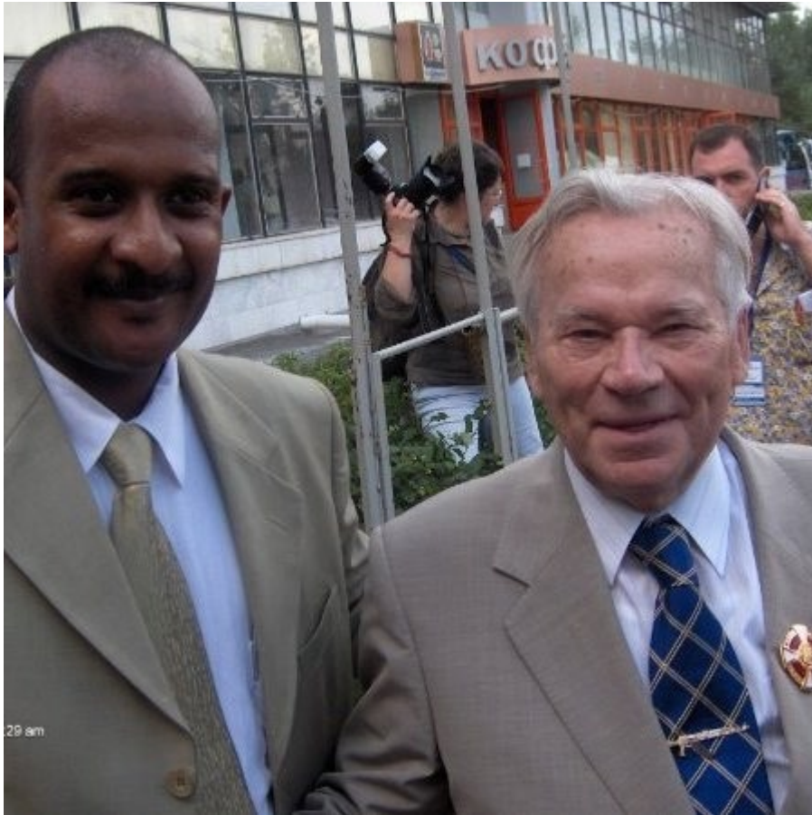
The General Manager of Wail Shams Trading.co, with Mikhail Kalashnikov (unknown date). 164

On the exporting side, besides Ashoka Manufacturing, the largest exporters to Sudan are Kalashnikov Concern and Molot. Together the two companies have exported at least USD 5.8 million worth of small arms to Sudan since 2019. These small arms manufacturers are partially owned by Rostec, Russia's state-owned defense conglomerate. Both of these companies seem to trade with a limited number of Sudanese partners, and mostly export firearms under specific HS codes that relate to "sporting, hunting or target rifles". These "sporting, hunting or target rifles" are frequently seen being used in conflict settings by both the RSF and the SAF.