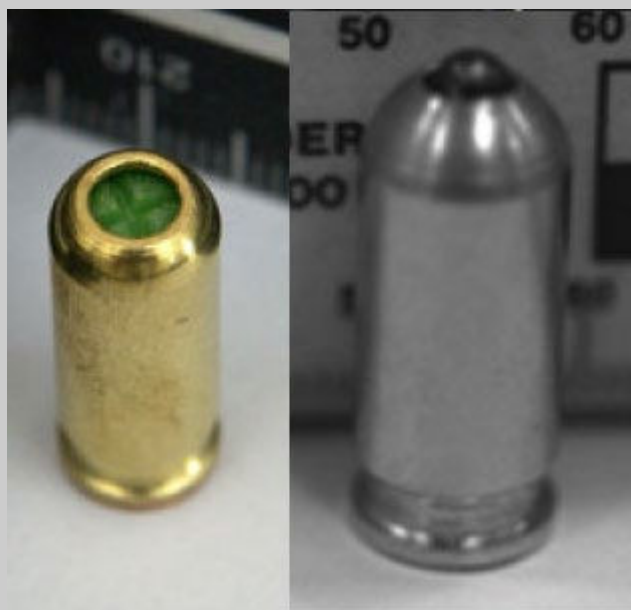
Left: an unmodified blank round; right: a blank round converted through the addition of a metal sphere. 171

While in most cases re-barreled converted handguns can be loaded with standard lethal ammunition, with the new barrel withstanding the increased pressure, blank guns that have been converted using the second technique can only be loaded with converted blank rounds. Again, various techniques can be used, one of the most common one being the removal of the plastic wad and the addition of a metal sphere as projectile, often a buckshot pellet, as depicted in the pictures below.