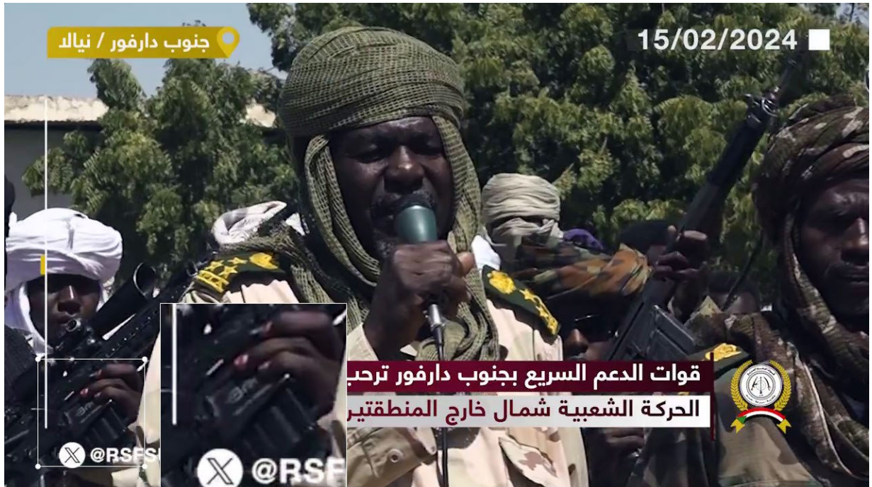
Edited screenshot of video posted by @Quick_news12 on X, with rifle highlighted. 63

value of USD 100,000. 60 All of these rifles have been imported into Sudan by a single exporter, referred to as “Osman Altigani Ali” in shipping records, 61 under the label “sporting rifles”. 62