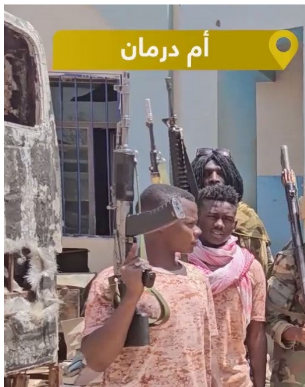
An RSF soldier equipped with a Vepr 1V-E, with its distinctive buttstock and striping marks on the foregrip. 114