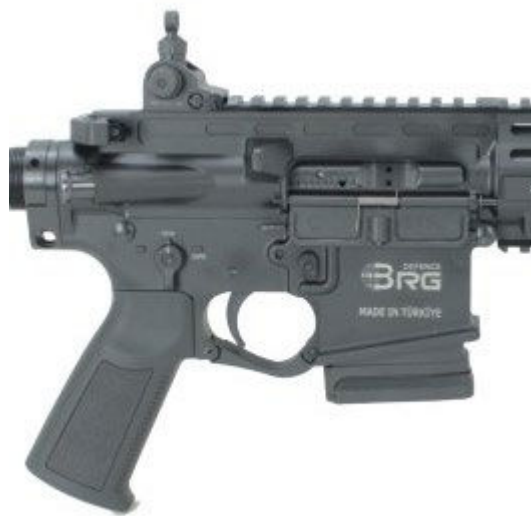
Close up of BRG 55 receiver. 64