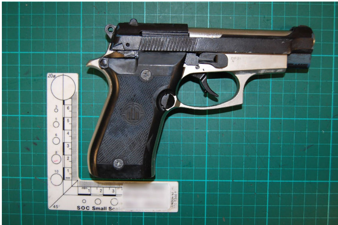
A converted Retay 84FS seized by British Law enforcement. 187

Industrial Complex, in particular Retay 84FS 185 and Retay Mod 92, have been seized by law enforcement units in various countries, after having been converted and sold on the black market. 186