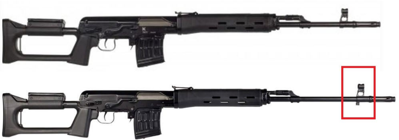
Above: A Tigr vers 1 (mod 2). 92 Below: a modern SVD, with the bayonet lug highlighted. 93