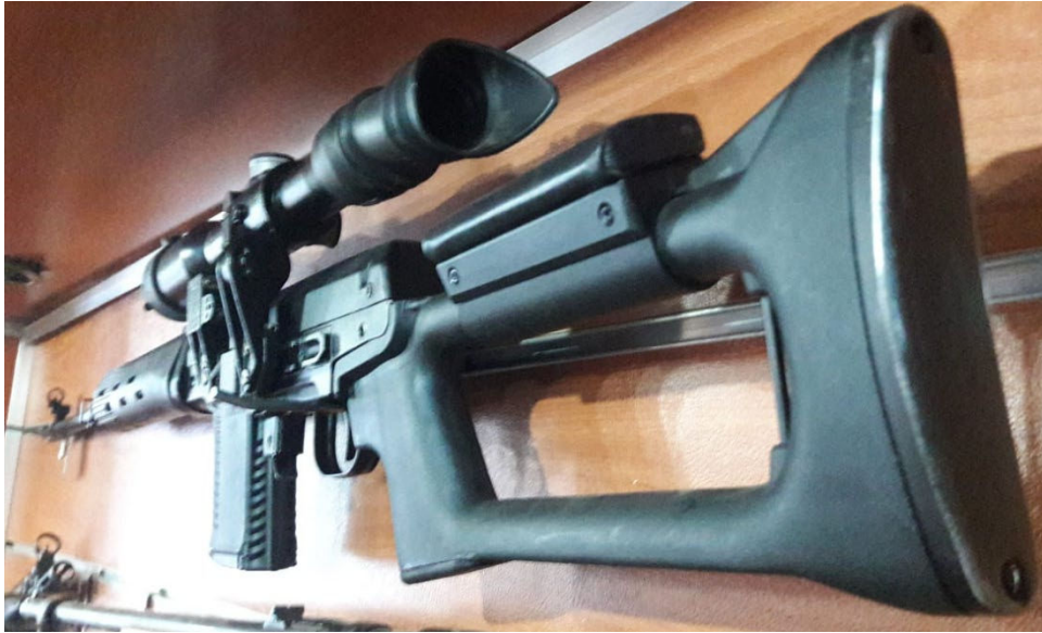
A Tigr DMR (.308 version) in the shop of an armourer in Khartoum that has purchased these rifles directly from Kalashnikov Concern. 89

Tigr Designated Marksman Rifles (DMR) are ubiquitous in the ranks of both the RSF and the SAF, almost everywhere in Sudan. Amnesty International was able to identify Tigr DMRs at least 24 times in videos shot in various parts of the country, including in Darfur. 88