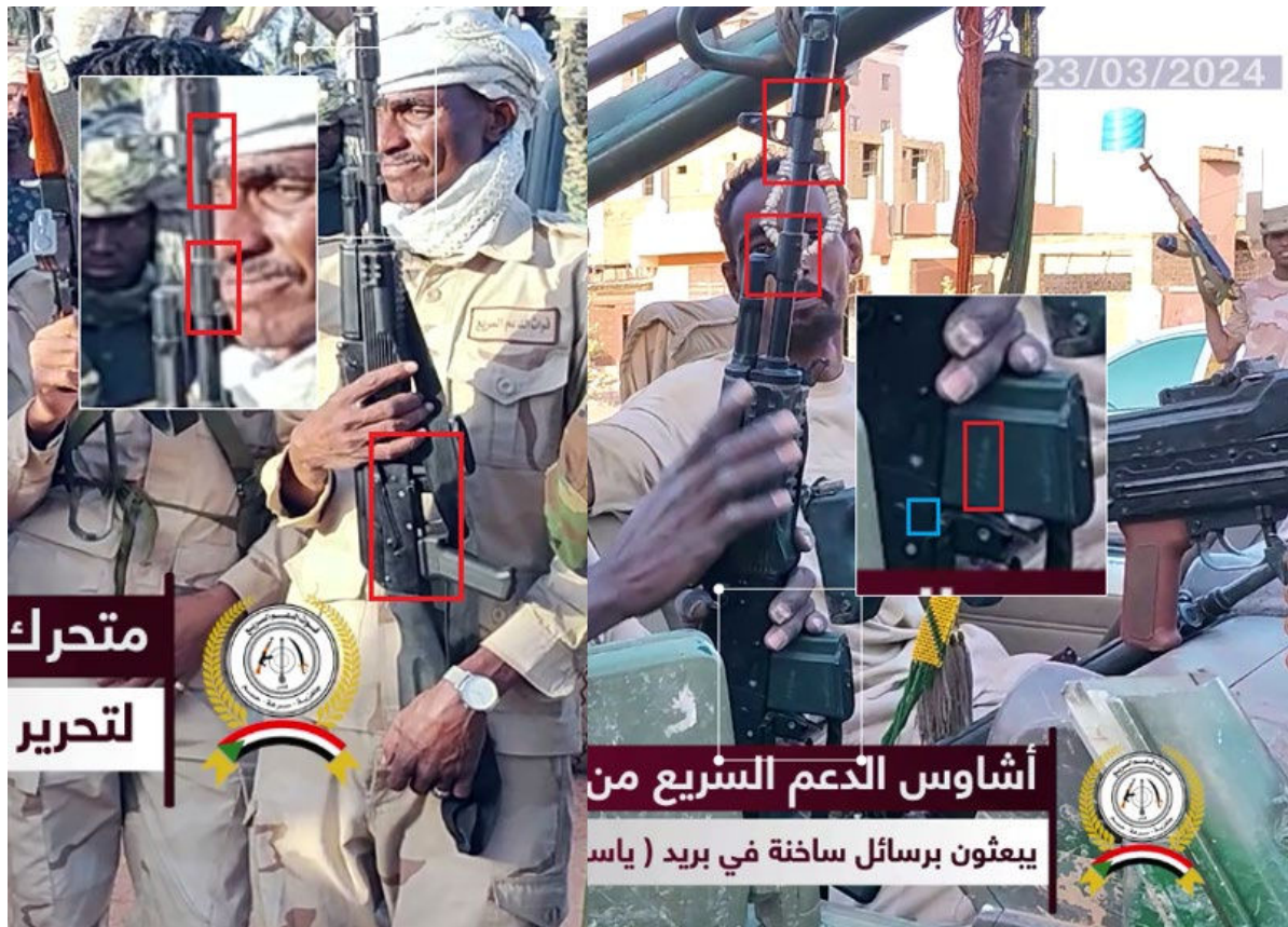
Left: Saiga-MK .223 Rem in Omdurman. 106 Right: same model in Khartoum 107 ; Both video stills have been modified by Amnesty for illustration.

In addition to Saiga MKs, Amnesty International also identified at least one Saiga 9 in digital evidence obtained by France 24. 108 Footage of RSF fighters looting homes, allegedly in Khartoum (which Amnesty is unable to independently verify), shows the highly distinctive (due to its straight, narrow magazine) 9mm version of the AK platform. 109 Saiga-9 rifles have been exported by Kalashnikov Concern to Sudan (in unknown quantities) at least once in 2019. 110