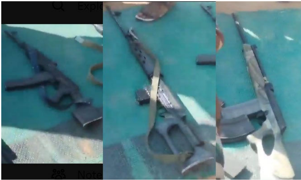
Left to right: a Molot Vepr 1V-E, a Tigr DMR and a Vepr.308 pattern rifle.

used by its soldiers. 113 The caption of the video claims it was shot in Omdurman, which Amnesty is unable to verify.