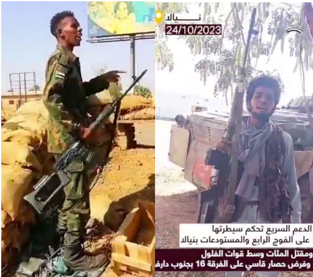
Edited screenshots of a videos showing a SAF soldier with a Tigr, near al-Nilin mosque in Khartoum 94 and an RSF soldier with a Tigr, in an RSF official video shot in Nyala (South Darfur) on the 24 th of October 2023. 95