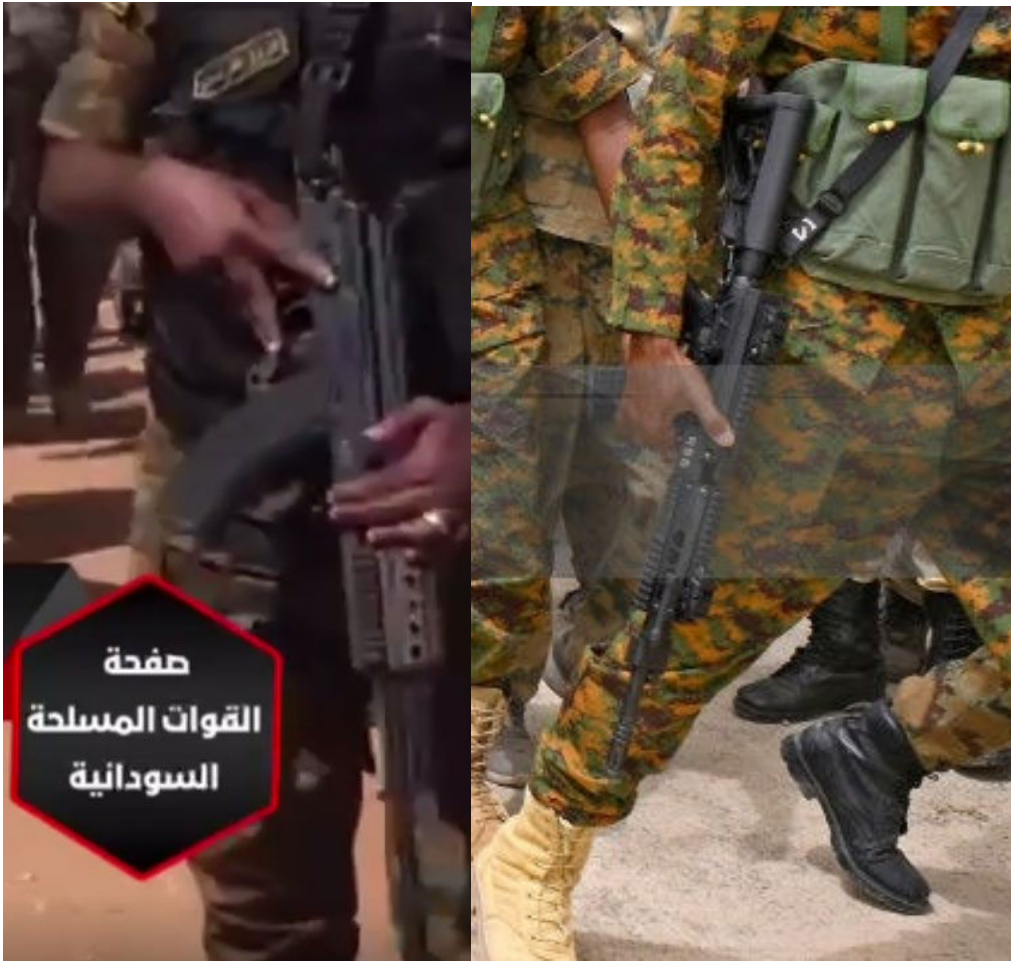
Left: Al-Burhan security detail equipped with SAR 15T; 85 Right: Al-Burhan security detail equipped with R56 86

rifles have been exported to two Sudanese companies (labelled as "Khalid omer attia for import and export enterprise" and "wail shams eldin hassan trading" in trade records). 84